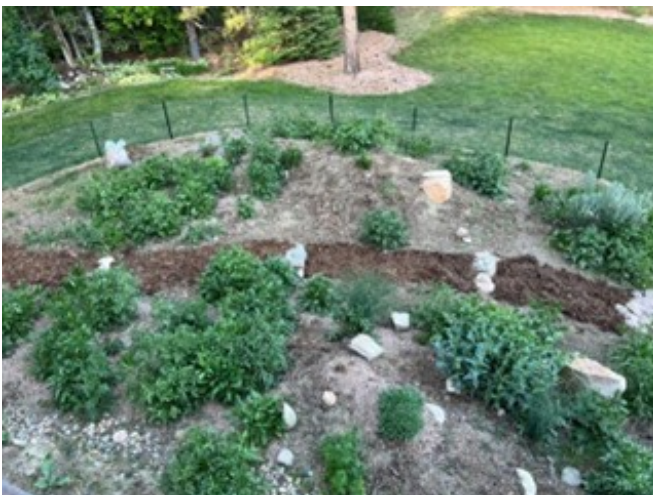
In the second year the weeds were under control.

By the second year, the native plant garden (and now native plant gardener) felt much more established. In May of the second year, many of the perennials came back and all the weeding the year before seemed to make a difference. There was now time to do a lot more observing and watching the garden grow.