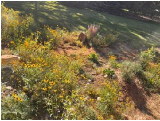
September of the first year (2023)

By the second year, the native plant garden (and now native plant gardener) felt much more established. In May of the second year, many of the perennials came back and all the weeding the year before seemed to make a difference. There was now time to do a lot more observing and watching the garden grow.