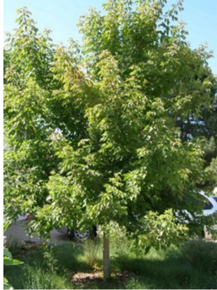
A young Boxelder tree (Acer negundo) supports 78 caterpillar species.

Question: Is there a list of Colorado keystone species? And, what do you think of the concept of Keystone species?