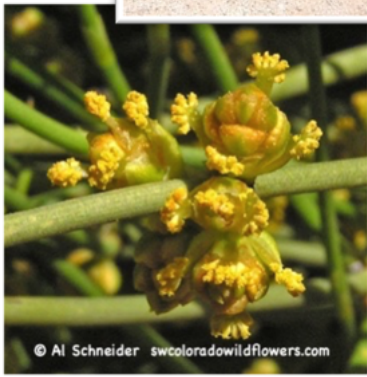
Male Floral Parts