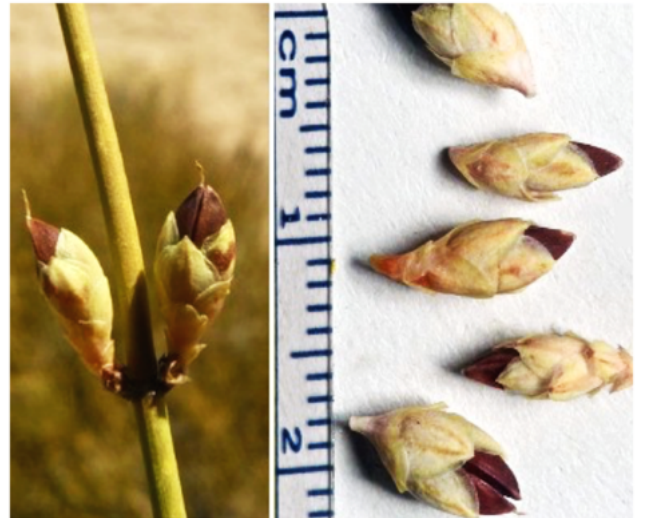
Ephedra viridis