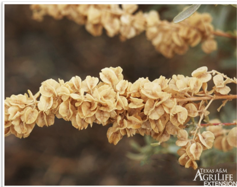
Female seed bracts

Propagation: Dioecious (i.e., male and female flowers are on separate plants). Store dry for 90 days. Soak the seeds in water for 24 hours. Cold stratify for 5 days. Sow and cover well. Seed can also be sown in situ in fall or early spring and covered well. When advancing from cells to a small pot, use a very well-draining medium. This species can rot easily in pot culture.